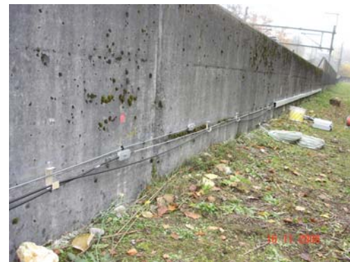
Installation of the Optical Strands, along the wall.